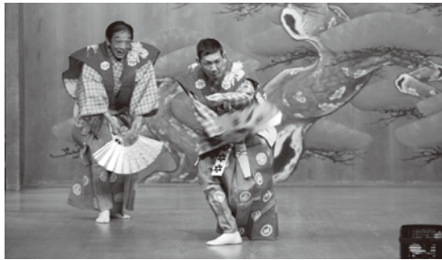
Kyogen "Busu"

A master orders his servants Taro-kaja and Jiro-kaja to watch the house while he is out. He also warns that they must stay away from a cask containing poison called Busu, as it is so fatal that even a breeze blowing from its direction can cause death. After he leaves, the two servants become so curious about the Busu. They open the lid, take a sip, and find that it is not poison, but black sugar syrup. They are so absorbed in eating that they ate it all up. And then, they begin to invent an excuse to get out of trouble.