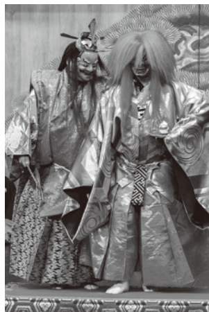
Noh "Shari"

A priest makes a pilgrimage to Kyoto and stops at Sennyu-ji temple to worship before a sacred relic of the Buddha that is kept there. In the evening, a Young Man appears in the hall where the relic is displayed and worships it with the Priest. In fact, the Young Man is the demon Sokushikki. The demon steals the relic of the Buddha and runs away from the hall. However, Idaten, a protector of the Buddha, appears and follows after the demon. Finally, Idaten retrieved the sacred relic.